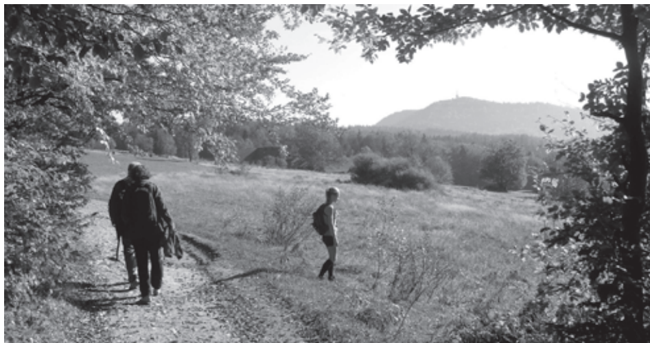
Fig. 2. Tourists on „Krzysie” clearing, heading Luboń Wielki